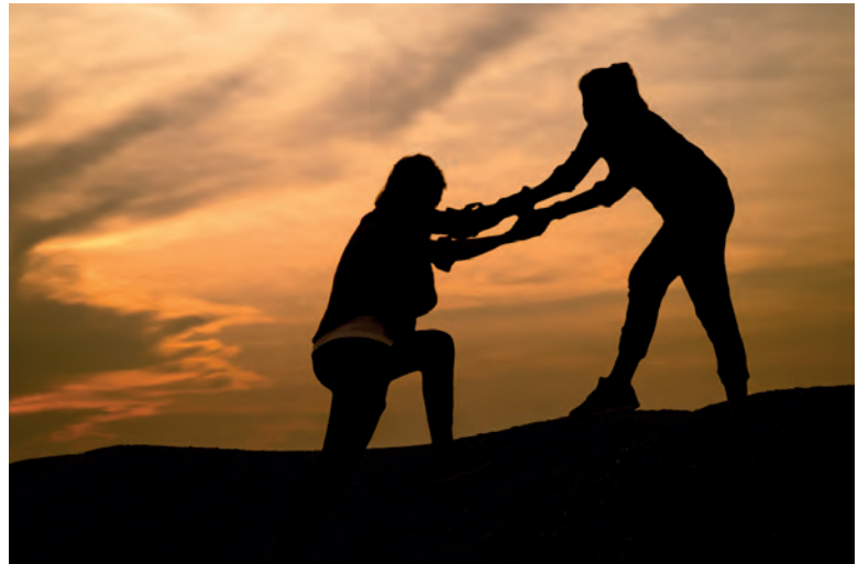
Those who are just, must be kind.